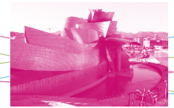
Musée Guggenheim New-York /// Abou Dhabi /// Bilbao