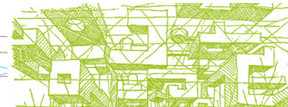
Musée du Louvre Paris [Pyramide] /// Atlanta /// Abou Dhabi